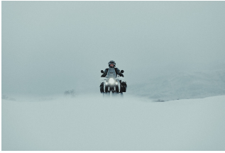
the Norden 901 Expedition 2023