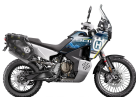
Norden 901 Expedition 2023 (13)