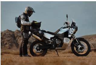
Norden 901 Expedition 2023 (17)