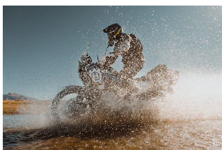
Norden 901 Expedition 2023 (8)