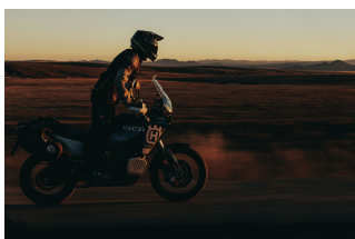
the Norden 901 Expedition 2023 (2)