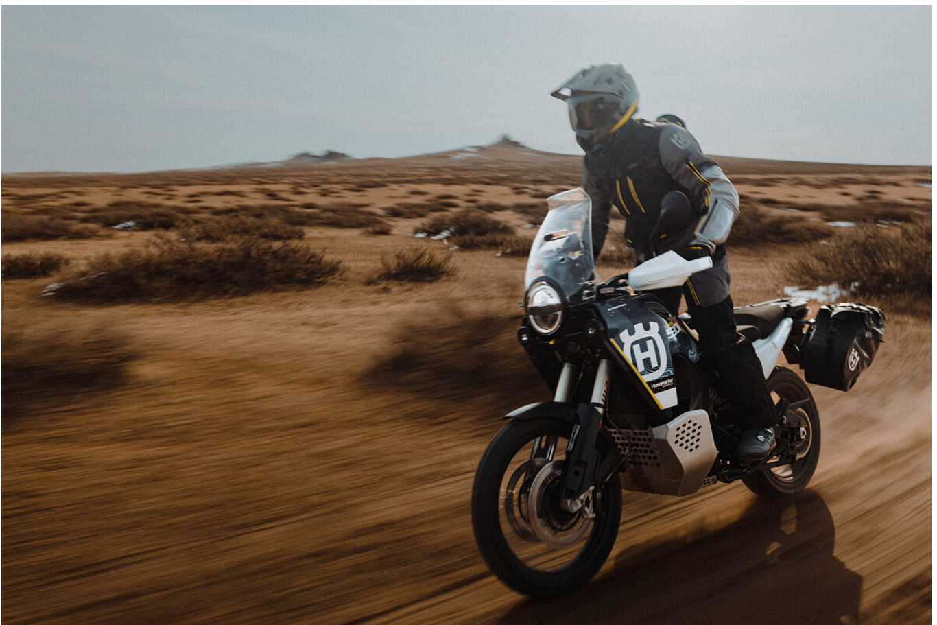
The new Norden 901 Expedition 2023

PREMIUM SUSPENSION AND ESSENTIAL TRAVEL COMPONENTS ALLOW RIDERS TO EXPERIENCE UNRESTRICTED GLOBAL ADVENTURES IN COMPLETE COMFORT