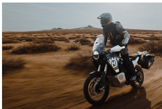
The new Norden 901 Expedition 2023