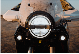
Norden 901 Expedition 2023 (15)