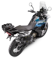
Norden 901 Expedition 2023 (14)