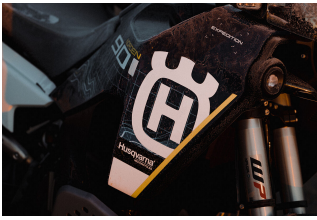
Norden 901 Expedition 2023 (10)