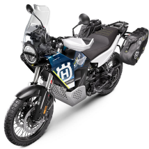
Norden 901 Expedition 2023 (11)