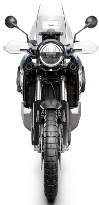
Norden 901 Expedition 2023 (12)