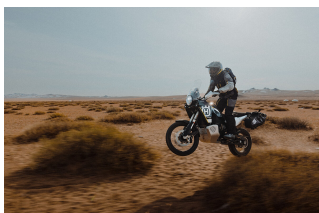
Norden 901 Expedition 2023 (6)