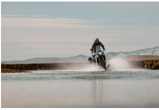
Norden 901 Expedition 2023 (7)