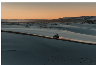
Norden 901 Expedition 2023 (4)