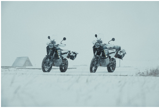
Norden 901 Expedition 2023 (16)